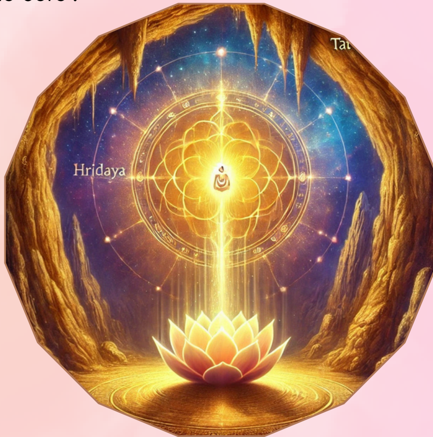
The core / Hridaya

Not everyone can realize this easily. Only those who have tasted their innermost core will come to know that it is Brahmam only. To reach the innermost core, one has to cross over all the boundaries of the mind and settle in the heart of their being. This is called 'the core'.