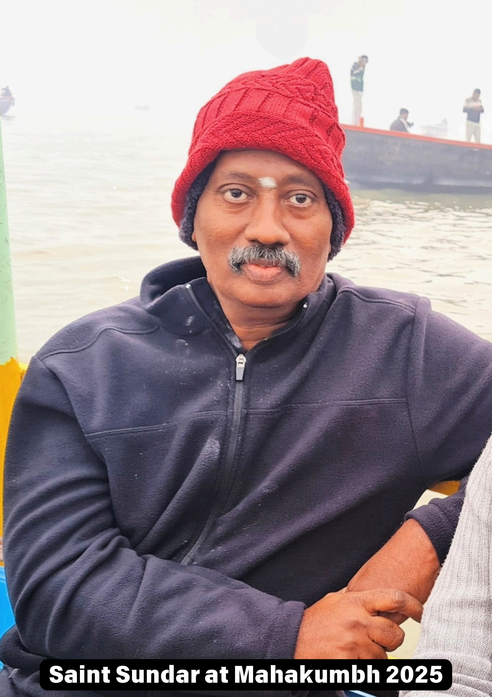
Saint Sundar at Mahakumbh 2025