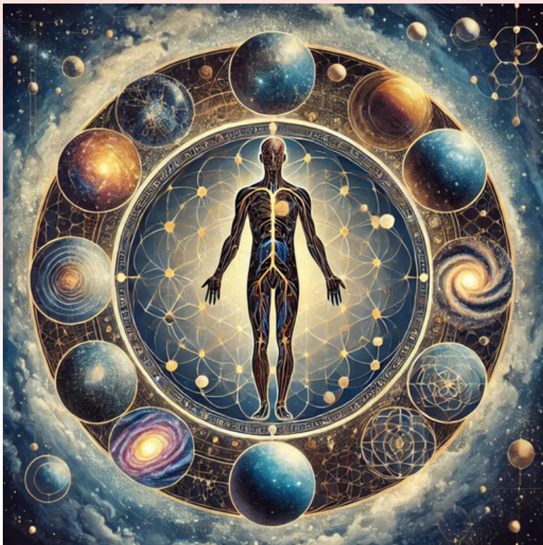
Intricate connection between Microcosm and Macrocosm

In Greek philosophy, they call this concept as macrocosm (universe) and microcosm (human body).