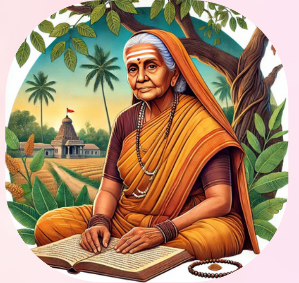
Tamil Poet and Saint Avvaiyar

meaning ‘Wherever I turn and wherever I see, I see only the absolute Parabrahman’.